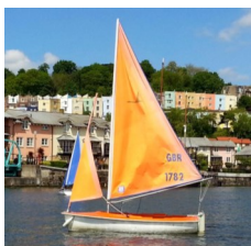
Access 303 Dinghy